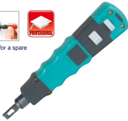
Twist-Lock type holder