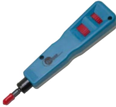
Twist-Lock type holder